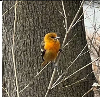
Baltimore Oriole

Other highlights were Cackling Goose, Surf and White-winged Scoters, 3 Red-necked Grebe, 2 Semipalmated Plover (4 th count record), Iceland Gull, Clapper and Virginia Rails, 5 Great Egret in 4-5 locations, including Tibbetts Brook Park in Yonkers and a flyover in Hastings-on-Hudson, Red-headed Woodpecker in Marshlands Conservancy, 4 Chipping Sparrows, Baltimore Oriole at a Yonkers feeder, 7 Orange-crowned Warbler (also a new high count), Nashville Warbler, Common Yellowthroat, and Palm Warbler.