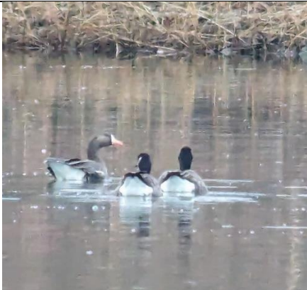
Greater White-fronted Goose

Highlights included two new species for the count. A MacGillivray's Warbler was found in the Riverdale section of the Bronx, and two Ash-throated Flycatchers, one in the southern section of Pelham Bay Park, one in Mount Vernon. The cumulative species for the count now stands at 236.