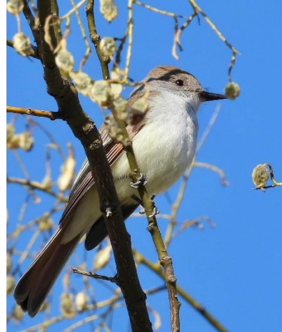
One of two Ash-throated Flycatchers

Highlights included two new species for the count. A MacGillivray's Warbler was found in the Riverdale section of the Bronx, and two Ash-throated Flycatchers, one in the southern section of Pelham Bay Park, one in Mount Vernon. The cumulative species for the count now stands at 236.