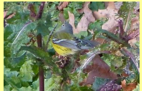
Magnolia Warbler (Tom Fiore)