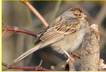
Clay-colored Sparrow (Gail Benson)