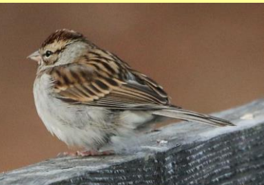
Chipping Sparrow