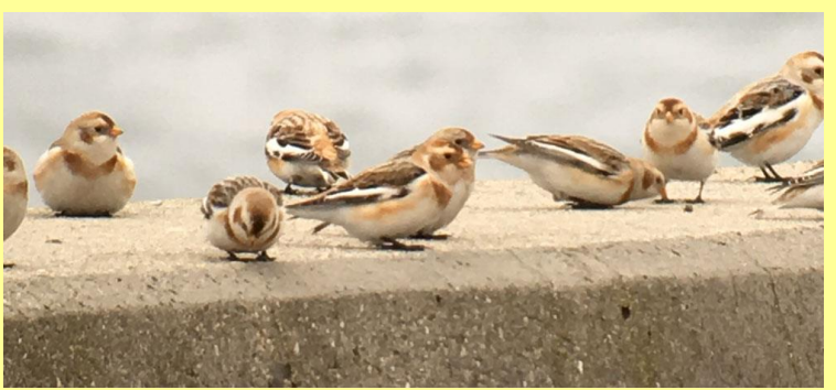
Snow Bunting