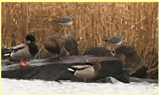
Greater Yellowlegs