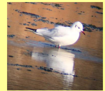
Black-headed Gull