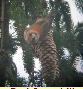
Red Crossbill