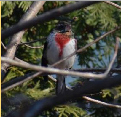
Rose-breasted Grosbeak (Violet Brill)