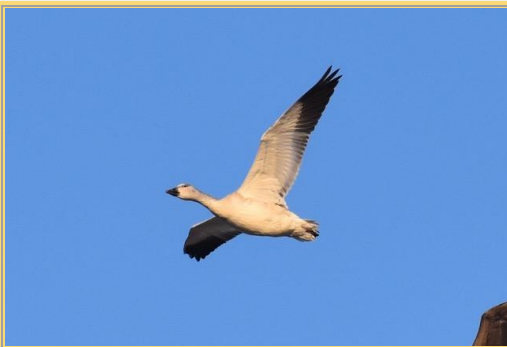
Snow Goose (Nathan O'Reilly)

The 96 th Bronx-Westchester Christmas Bird Count found 115 species on Sunday December 22, 2019. An additional 3 species were seen count week. Highlights included a 4th record for Greater White-fronted Goose at Edith G Read Sanctuary in Rye; Lesser Black-backed Gull in Manor Park; Count Week Red-headed Woodpecker in Pelham Bay; House Wren; 15 Chipping Sparrows; White-crowned Sparrow; Yellow-breasted Chat in Marshlands Conservancy; Five species of Warbler, Orange-crowned Warbler in the Botanical Gardens; two Nashville Warblers, one at Rory O' Moore Park in Yonkers, the other at a feeder in Harrison; Common Yellowthroat in Van Cortlandt; 6 Pine Warblers in the Botanical Gardens and Kings Point; 7 Yellow-rumped Warblers; and a 5th record of a Rose-breasted Grosbeak at a feeder in Mamaroneck.